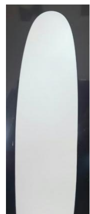
AMS KRONOS 2971