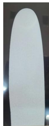
市場同等品 (処理TiO 2 )

方法：顔料をディスパーを用いてラッカーベースに分散する。PETフィルムにアプリケーター（厚さ0.1mm）を用いて塗布する。