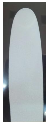
市場同等品 (処理TiO 2 )

方法：顔料をディスパーを用いてラッカーベースに分散する。PETフィルムにアプリケーター（厚さ0.1mm）を用いて塗布する。