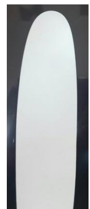
AMS KRONOS 2971